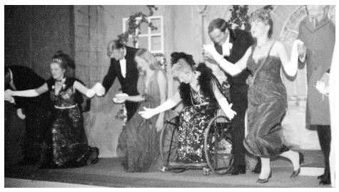
Ring Round the Moon, 1979

That is what the Dedham Players, which started half a century ago as a Women's Institute drama group, have achieved, moving away from familiar