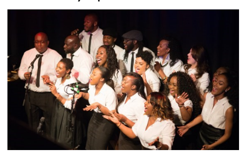
Gospel Singers Incognito 22 Oct

Gospel Singers Incognito , The Wolsey, 7pm.