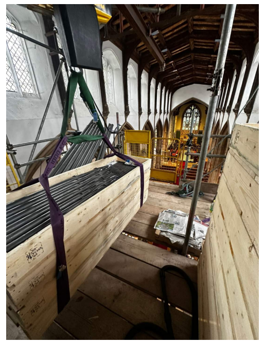
Pipes carefully packed for re-use.