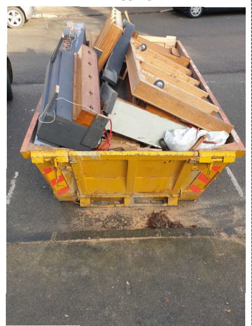
The dismantled organ console.