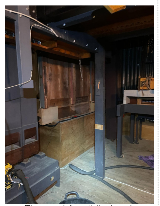
The organ loft partially cleared.