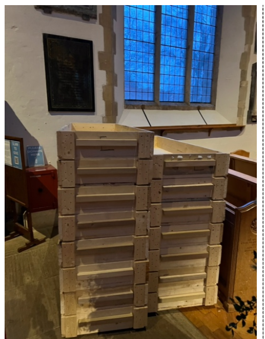
Wooden shipping crates.