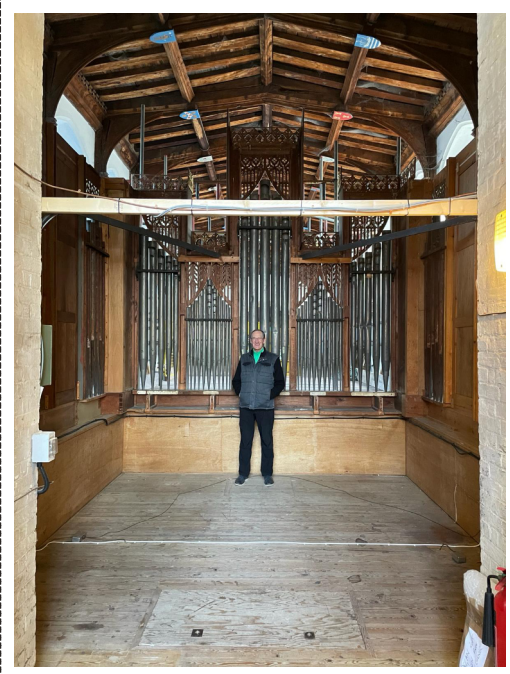
The organ loft cleared.