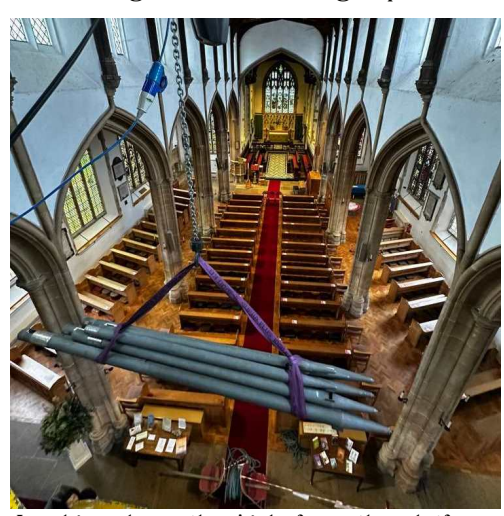
Looking down the Aisle from the platform with a load of pipes ready to be lowered to the floor.