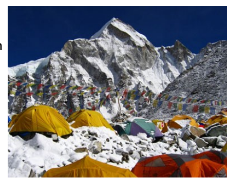
Everest Base Camp