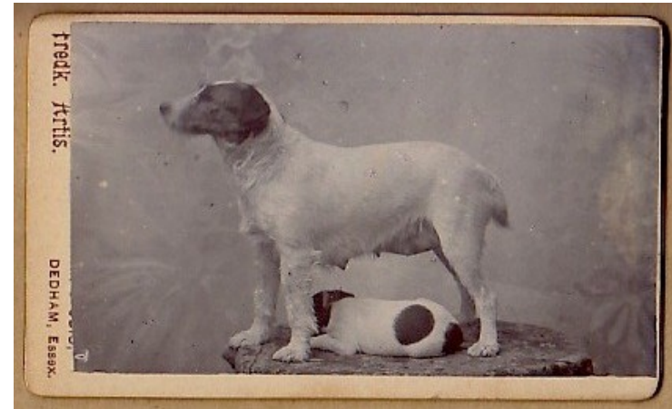
Mother and puppy