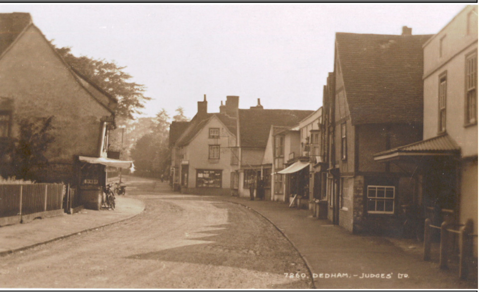
Dedham High Street (view West) 1923 from the postcard collection of George Beeken