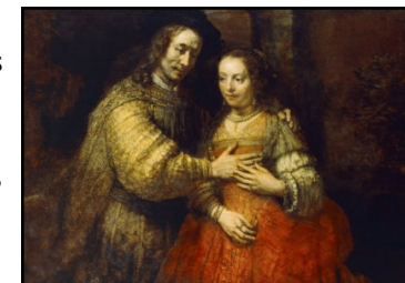
Rembrandt's The Jewish Bride

Rembrandt excelled in historical scenes as well as more intimate portraits, and his large workshop trained students who went on to be great artists in their own right. He died in 1669, and in the last years of his life painted this month's artwork The Jewish Bride .