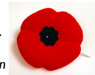
Canadian poppy pin

McCrae came from Guelph, Ontario, where a brother-in-law of mine lives. I have been there and know something of the pride that Canadians take in their nation's part in that great struggle and the heritage they have in that poem, as well as in the impressive stone monuments to their fallen, such as those in Ypres and Vimy.