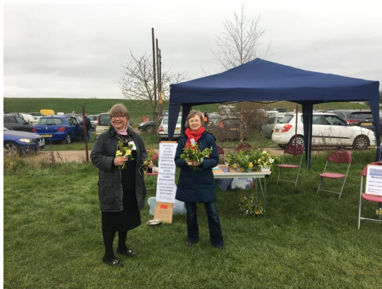
Church at Boot flowers given out on Mothering Sunday

Our vision for 2019 is shaped by the verse - Matthew 9:36 'When He saw the crowds, He had compassion on them, because they were harassed and helpless, like sheep without a shepherd.'