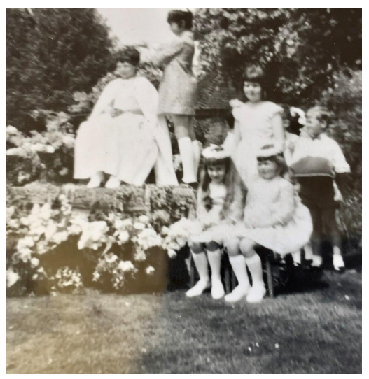
The previous year's May Queen crowns her successor in the 1950s. On the right are her attendants and the pageboy carrying the cushion used for bearing the floral crown.

all May Day ceremonies. A revival took place on the Restoration of Charles II but it is possible that the tradition here dated only from the great renewal of interest in local traditions and folk dancing in the late nineteenth century.