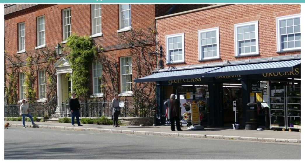
Sign of the times, empty High street and a of volunteers. queue outside the co-op

Birchwood decided to close at the start of the lockdown, mainly because of a shortage of staff. Instead they have concentrated on deliveries, with an offering of four standard vegetable boxes priced at £20 and £25. In addition they deliver bread, eggs, milk and potatoes as additions to the box orders