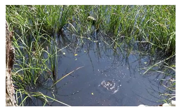
Year six leavers, we all make waves, make good waves.